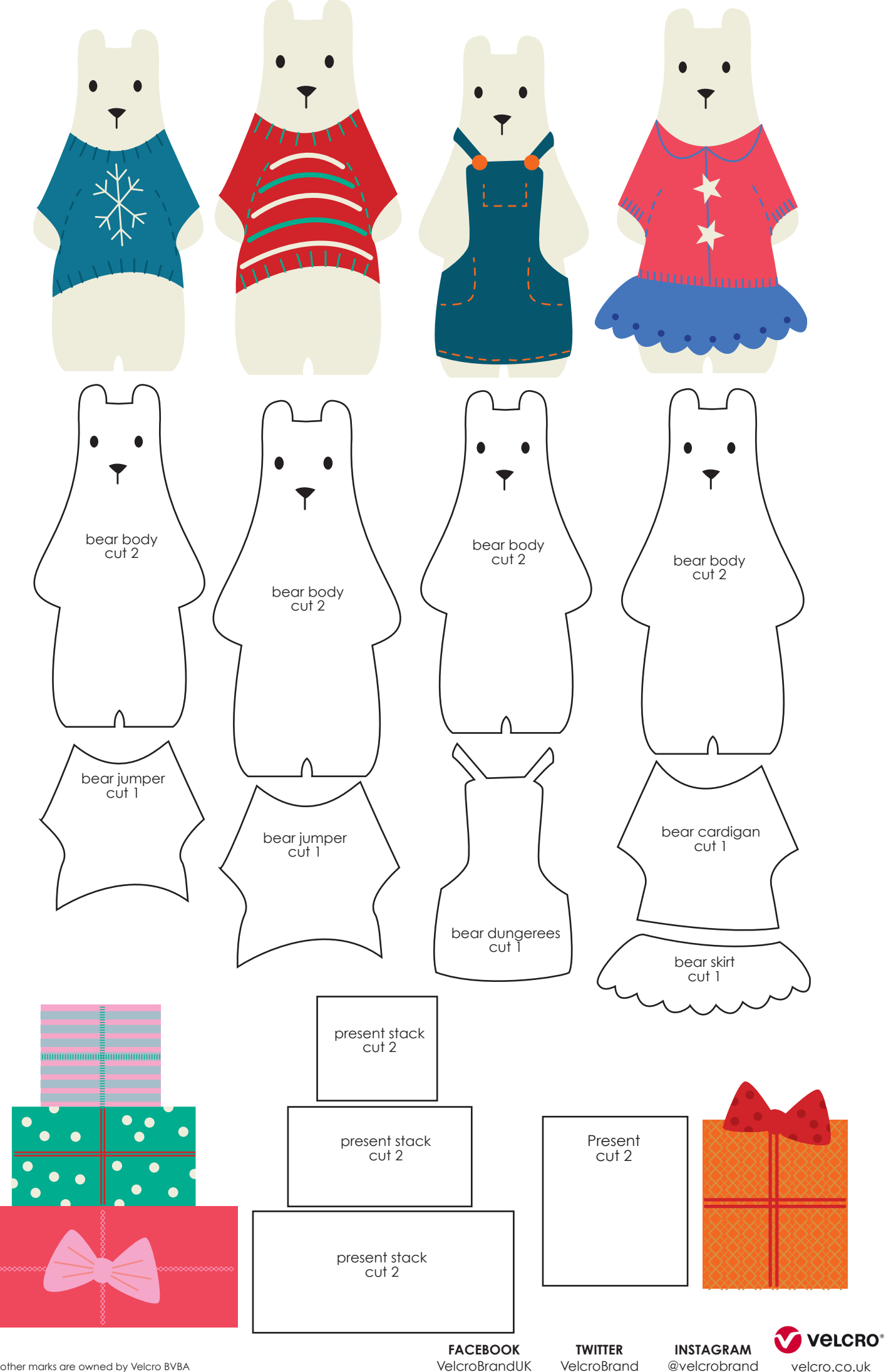
VELCRO and other marks are owned by Velcro BVBA