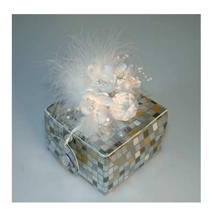
Wedding Favor Gift Box